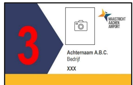
Figure 1 badge with access to demarcated area (number 3) and permission to remain on airside during calamities (the red colour of the number)