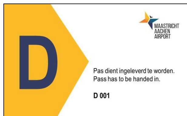
Figure 2 A visitors badge / a badge for one day

Visitors have a visitor badge which is issued by security. However, visitors should never be unattended on airside. Therefore, an attendant is always noted who is responsible for the visitor's behaviour. Visitors cannot enter the site for no reason, there must be a valid reason for this. If you have to take a visitor with you on airside or other protected areas, you can request this via Airport Operations using the special form which you can find on www.maa.nl .